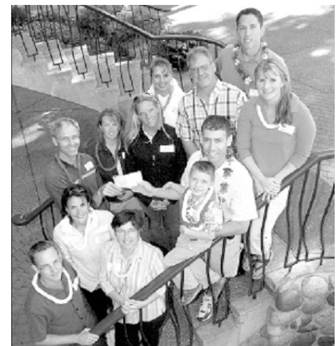
The Dental Unit donated $2025 to the Comox Valley Child Development Association.

Dent Det Comox fundraises on the Wing with many draws throughout the year. The Christmas Cheer Basket is always a great success. Additionally, this year all of the returnable items from the Air Show were delivered to the dental clinic to sort and contribute to our fundraising efforts.