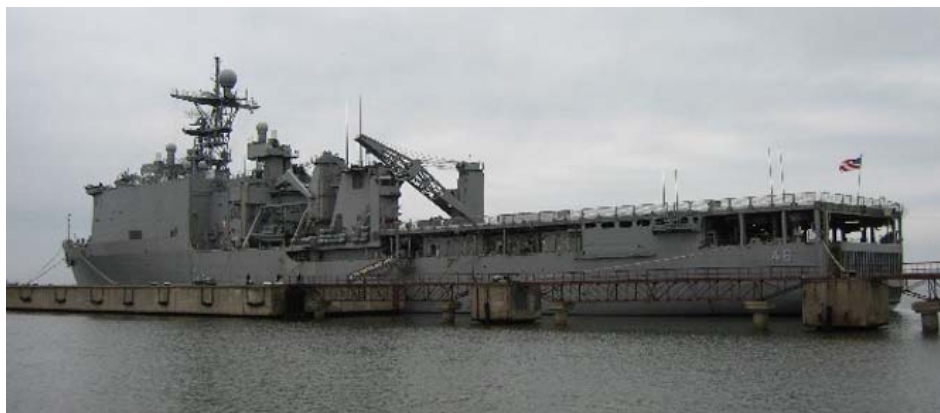
USS TORTUGA docked in Latvia

The TORTUGA carries with it four Landing Craft, Air Cushion (LCAC) and a large flat-deck hovercraft, which can exit the ship and speed to land, continuing right up onto the shore where the Marines can rapidly disembark. The TORTUGA is 609 feet in length, 84 feet tall with a cruising speed of 20 knots. While this vessel is not heavily armed with offensive weapons, we traveled with two destroyers, the USS COLE and the USS ANZIO, which had more than enough firepower to protect us.