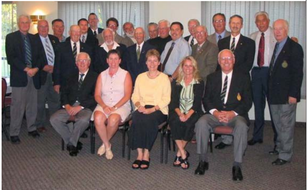
RCDCA Golf Tournament Dinner CFB Trenton Sept 21, 2005

This year's golf was at CFB Trenton (Sep 20-21, 2005) and we had a meet and greet BBQ and a dinner with a few prizes after the golf. In addition to great weather, good golf and lots of fun we had a chance to meet old friends and meet some new ones as can be seen by the photo. Why not golf with us next year? It will be at CFB Trenton Sep 19-20, 2006.