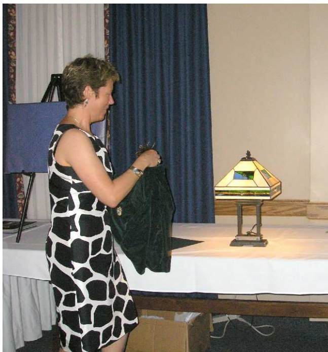
From 1 Dental Unit, a beautiful stained glass lamp in dental colours, embedded with CFDS collar dogs

There were tributes to her in the form of messages, gifts, PPT photo display and in song. I would like to thank all, military and civilian, who contributed towards the gifts presented to her.