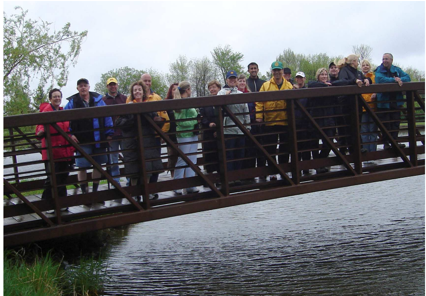
NCR Dental Staff celebrated the Corps birthday with a volksmarch along the Rideau Canal

all extractions and amalgam [sic] fillings before the contingents leave Canada for overseas service, and temporary appointments should be made for this service as occasion requires. To ensure that the men's teeth are kept in proper condition during the period of the war, the following details are authorized for employment on this service." The remainder of the order details that there shall be a Chief Dental Surgeon attached to each Div HQ and how many dental surgeons are authorized at brigades, hospitals, etc.