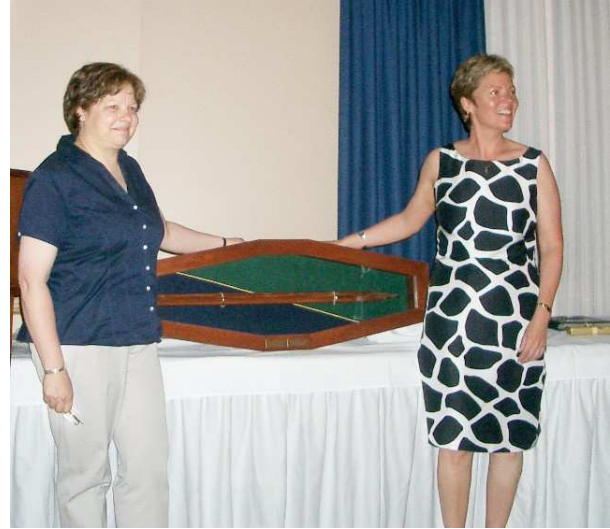
Presentation of pace stick and cabinet on behalf of CFDS personnel

I recently received from the CDA two large boxes of toothpaste samples that will be forwarded to the troops in Afghanistan.