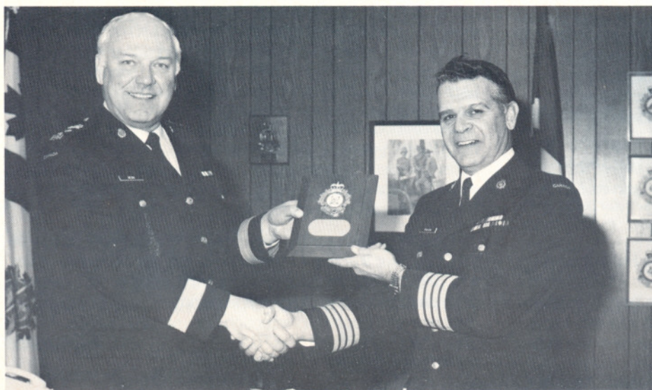
DGDS Visit to 1 CFSD. L to R: BGen Begin and Col Chiasson, CO 1 CFSD

7 et 8 août 1986 — Remise des diplômes du PFDM à Borden 20 au 25 août 1986 — Congrès de l'Association dentaire canadienne à Halifax. 4 au 6 septembre 1986 — Tournoi de golf du SDFC à Trenton 23 au 28 octobre 1987 — Visite au QG de la 35 e unité dentaire, Détachements dentaires de Lahr et Baden 29 octobre au 1 er novembre 1986 — USAREUR et 7th Army Dental Training Conférence à Garmisch 6 novembre 1986 — Conférencier invité à l'ESDFC à Borden (Cours de chef de détachement dentaire) 22 novembre 1986 — Dîner soulignant la retraite du major général H.T. Chandler, à Washington, E.-U. 2 au 7 décembre 1986 — Visite au QG de la 12 e unité dentaire à Halifax (Halifax, Shearwater, Greenwood, Cornwallis)