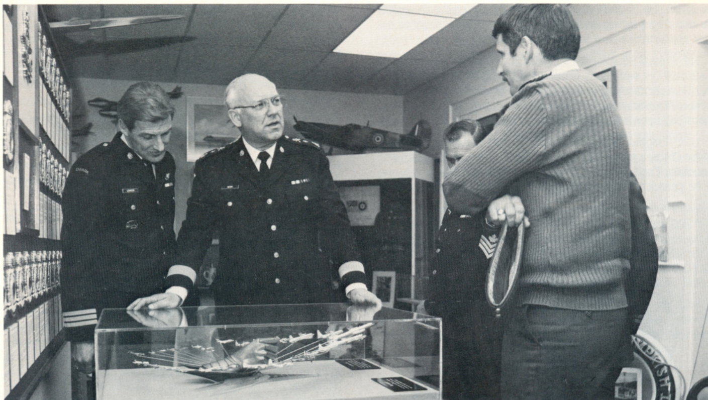
DGDS Visit to 13 Dent Unit and Air Force Museum. L to R: LCol Lemieux, BGen Begin, Col Diamond

2-4 Feb 87 — DGDS/Unit Commanders Workshop Ottawa 9-12 Feb 87 — Visit 13 Dent Unit Trenton (London, Toronto, Kingston)