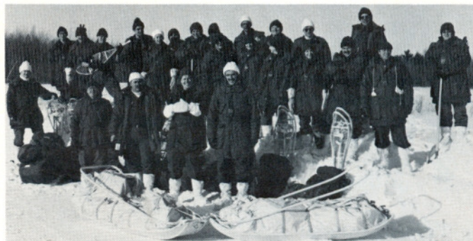
15 Dental Unit participants of the first week 19-21 Jan 87

All in all it was felt that the exercise readily achieved the aim. Such success would not have been possible without the outstanding effort made by all members of the Unit who so willingly contributed their time, effort, ingenuity and, most of all, sense of humour to the training. Bien fait tout le monde!