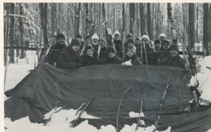
The lean-to construction workers pause a moment to show the partial completion of their shelter.